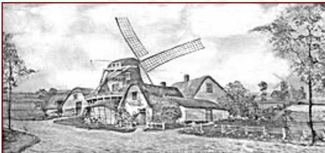
94. Holland Dutch cottages with thatched roofs accompany windmills along path, which is lined by wooden fences.