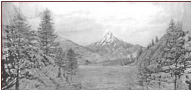
39. Mountain Snow-capped mountain in center, surrounded by fir trees and rocks.