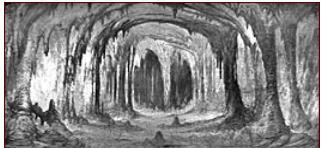
449-G. Cave Stalactites and stalagmites from columns, left and right, which lead to center. Opening is approximately 18'H x 20'W.