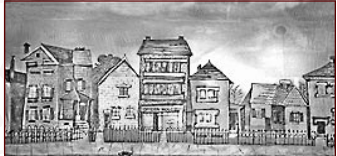
27-E. Kiddie Street Caricature street showing buildings fenced by wrought iron.