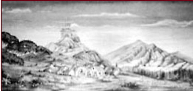
1-AC. Fairyland Castle in distance atop mountain.