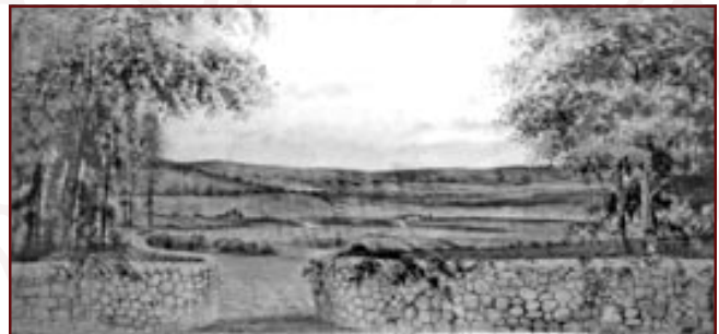
48-C. Irish Landscape Gently rolling hills are seen over stonewall with gate.