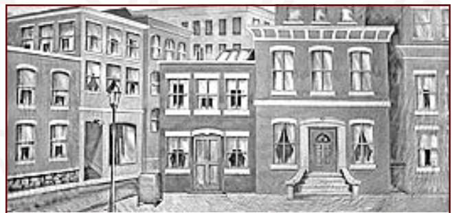
75-E. Tenement Street 43' x 21' - 40 lbs Brick and stone apartment buildings with sidewalk, mailbox, and lamppost on street corner.