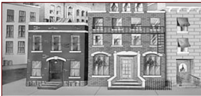
75-C. Tenement Street 43' x 21' - 36 lbs Bright and stone apartment buildings with sidewalk in foreground and additional buildings in distance.

You will find all of that and more at www.schellscenic.com !