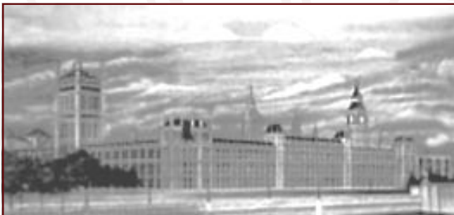
22-A. London Tower

Parliament, Tower of London and Big Ben.