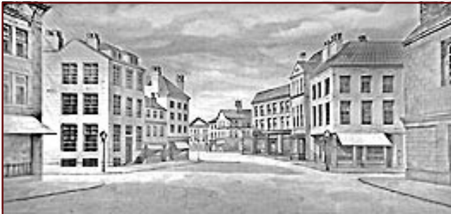
11-C. European Street