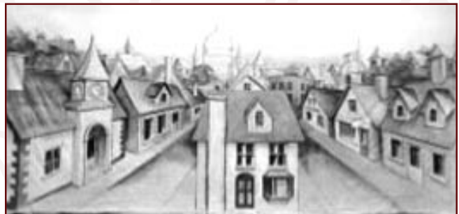
95-A. London Street

London residential neighborhood looking up streets towards St. Paul's Cathedral and other buildings.