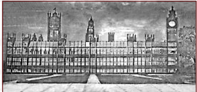
22. London Tower

Parliament building and Big Ben at night with lit windows.